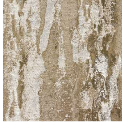
SECOND FIRING 3