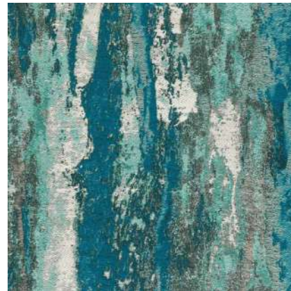
SECOND FIRING 7