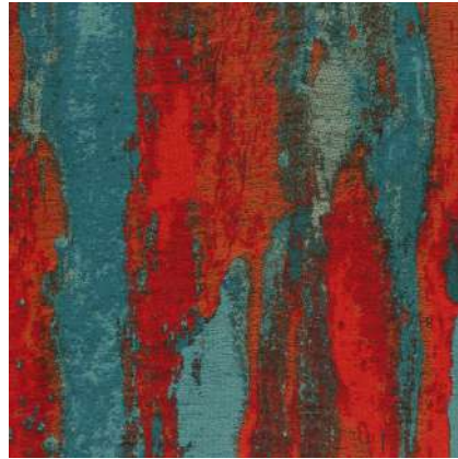
SECOND FIRING 10