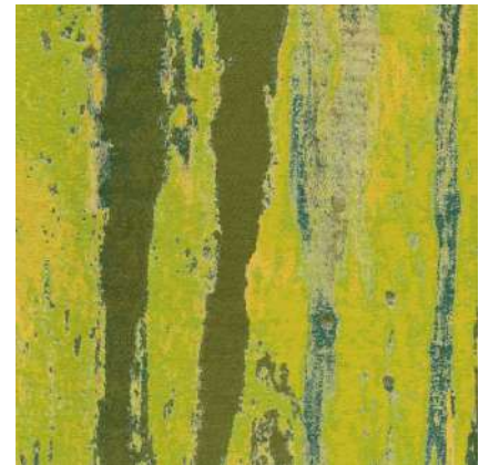
SECOND FIRING 8