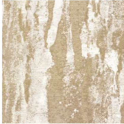
SECOND FIRING 2