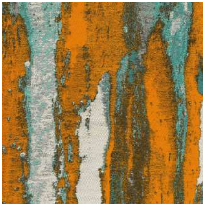
SECOND FIRING 5