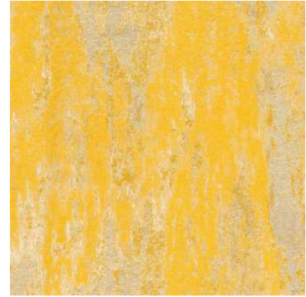
SECOND FIRING 4