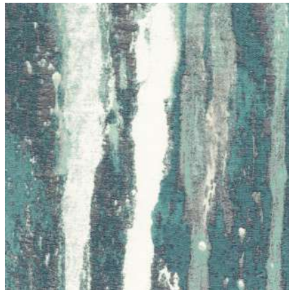
SECOND FIRING 6